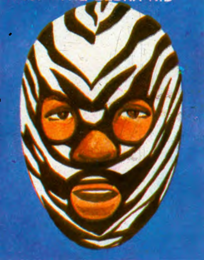
183.—THE ZEBRA KID